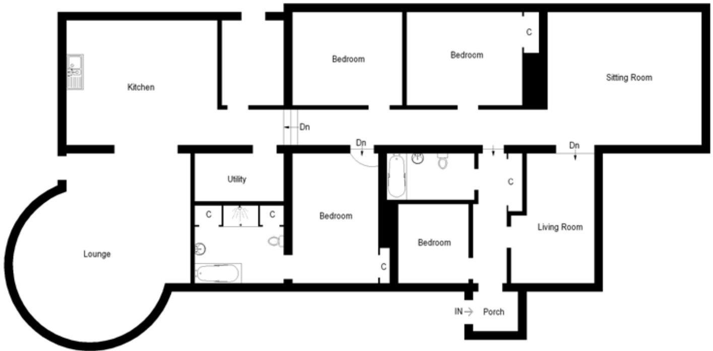
Illustration For Identification Purposes Only. Not To Scale (ID233312/ Ref:53945)